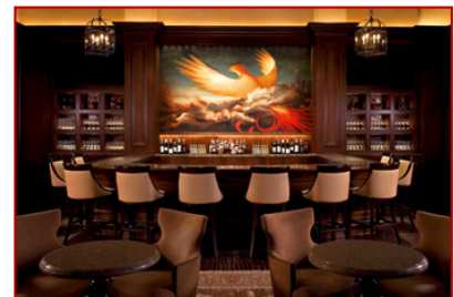
St. Regis Wine Bar