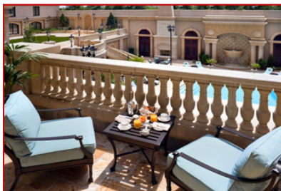
View from Caroline Astor Balcony

To make reservations with Virtuoso rates and complimentary amenities, call Linda Terrill at 800-863-9067.